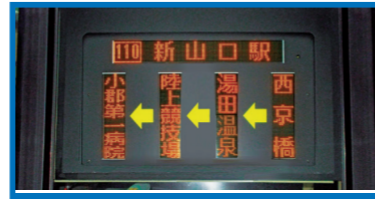
Destination sign on a side of the bus