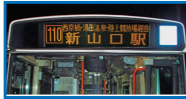
Destination sign in front of the bus