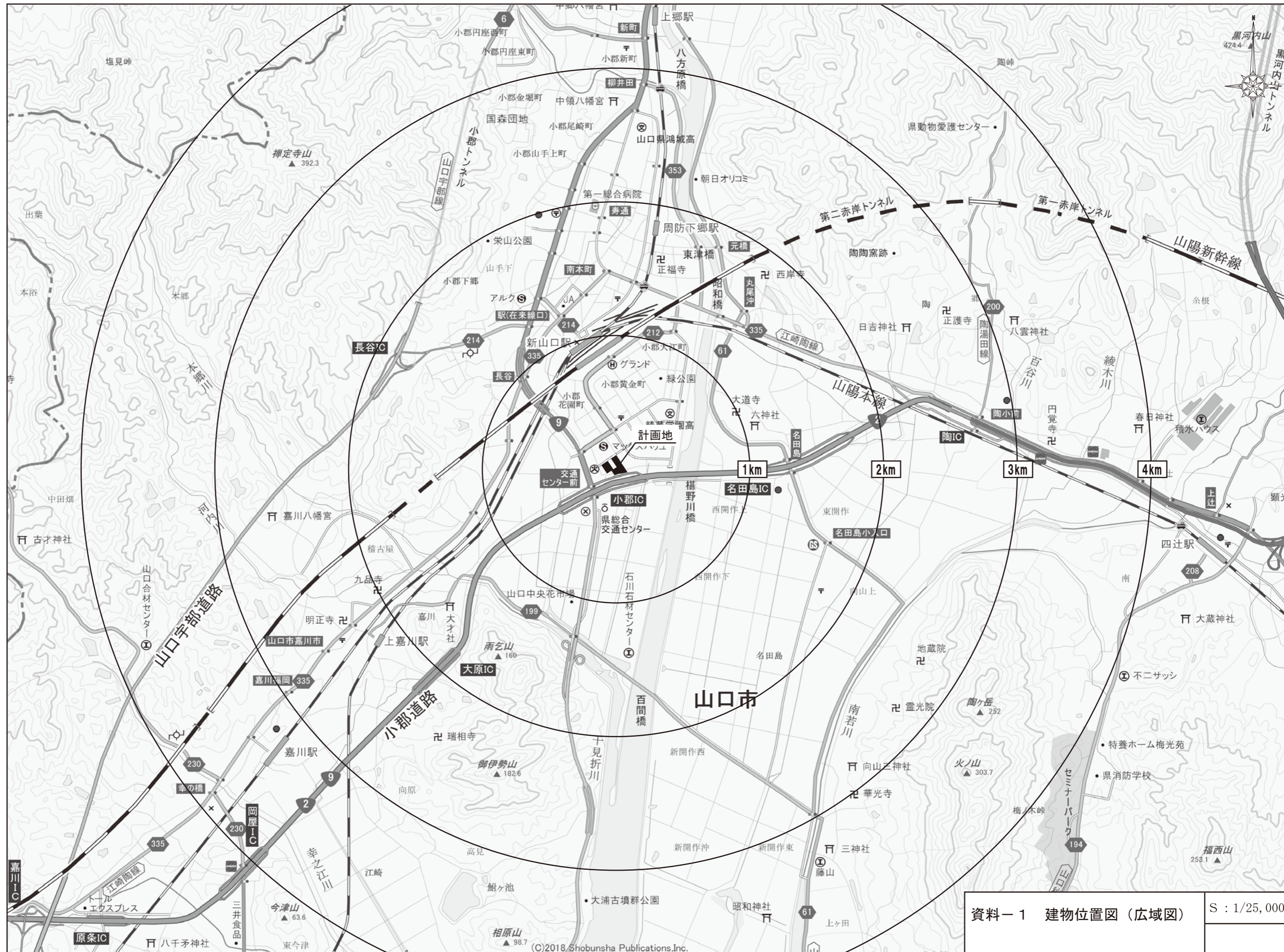
資料-1 建物位置図 (広域図) S : 1/25,000